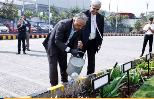
Planting of saplings