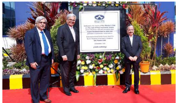
Unveiling of the Inauguration Plaque