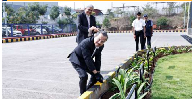
Planting of saplings