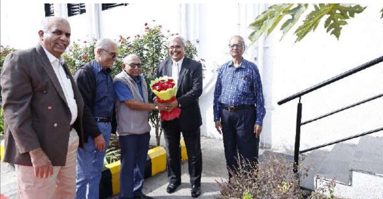
Welcoming of Guests